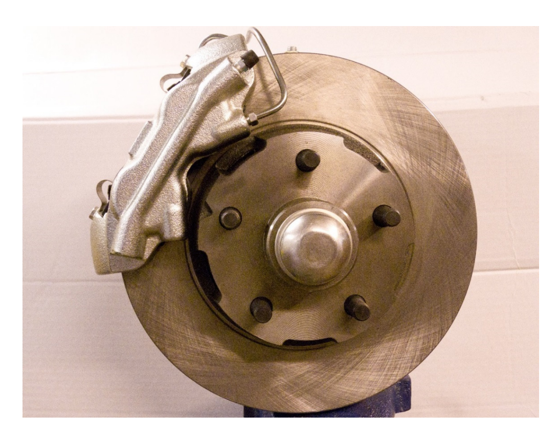
← Front of Car