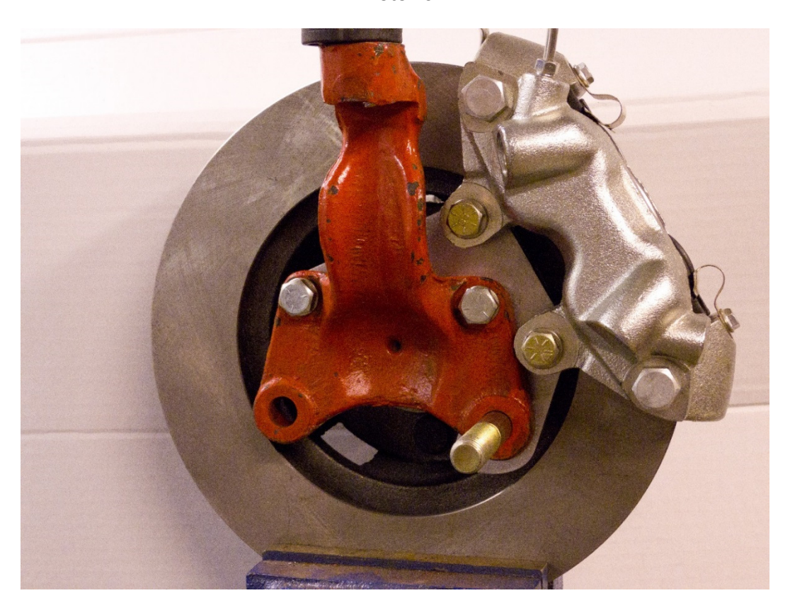
Front of car→